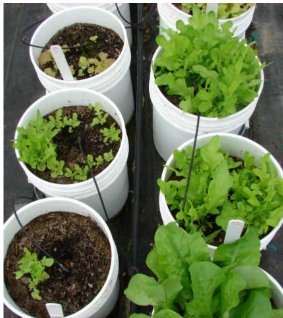
Figure 1. Lettuce seeded late August, 2009 after removal of tomatoes. All plants received compost tea through the drip irrigation while plants on the right received an additional 50 ml directly into the top of the bucket.

Buckets were placed in double rows as tightly as possible giving a plant spacing of approximately 14 inches in and between rows. This spacing was too close making it difficult to carry out cultural activities. A spacing of 18 to 20" in the row would have been more suitable.